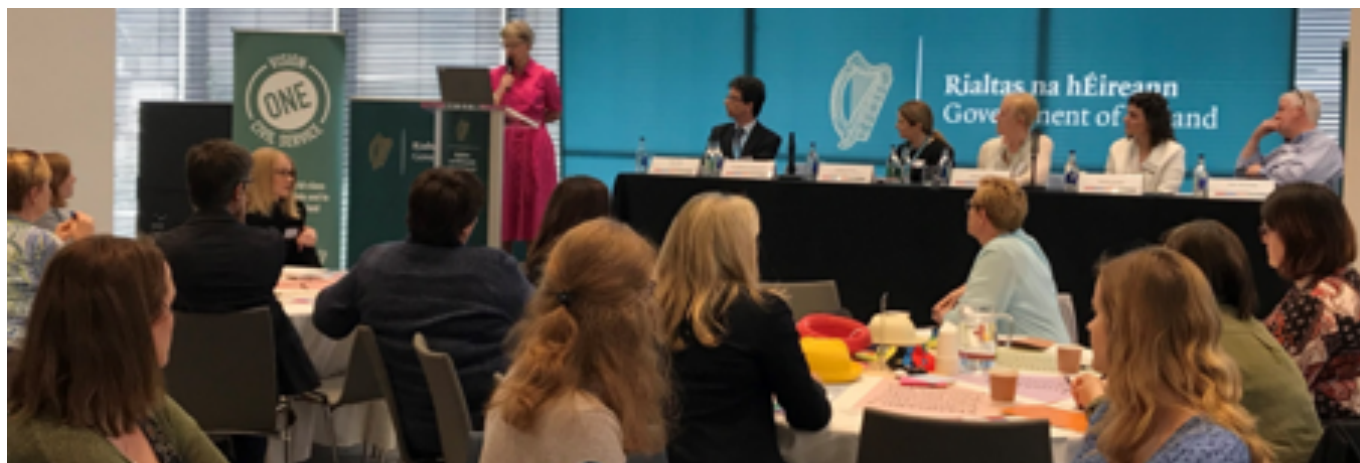
Minister Katherine Zappone at the School-Age Childcare Open Policy Debate in DCYA

As part of the public consultation on future regulations and standards for School-Age Childcare, the Minister recently hosted an Open Policy Debate. This generated rich discussions and offered us valuable insights from the sector on the priorities, the challenges and solutions to those challenges.