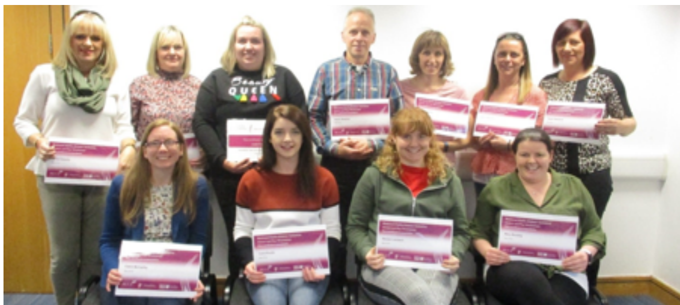
NSAI Aistear and Play participants, Cork City, May 2019

Aistear and Play consists of 5 individual workshops (each 2.5 hours in duration) and two onsite support visits with an Early Years Specialist to support participants to apply the learning within their own settings. The aim of the CPD is to support practitioners' understanding and use of Aistear and the Aistear Síolta Practice Guide to improve the quality of early childhood curriculum for children from birth to six years. The value and importance of play in supporting children's learning and development is a central theme running through the CPD. There is also a focus on developing quality learning environments, facilitating playful interactions and supporting the development of a play-based, emergent curriculum.